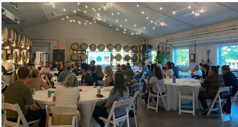
Borealis Beach Dialogue Dinner