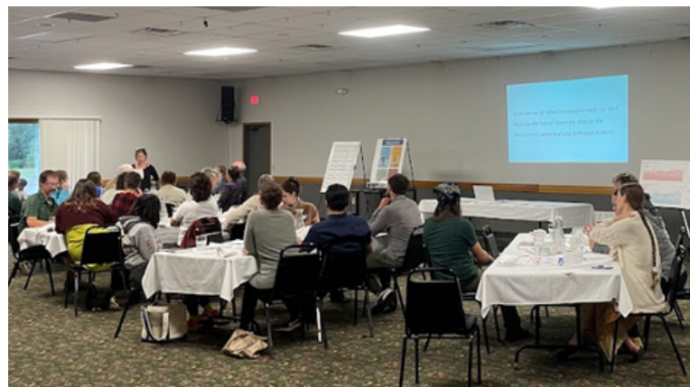
Iron Core Dialogue Dinner